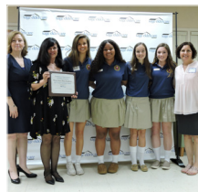
Mount Saint Mary Academy

Home Health Aide of the Year Award names the individual who is recognized for their continuous dedication and service to providing quality home care to SAGE clients.