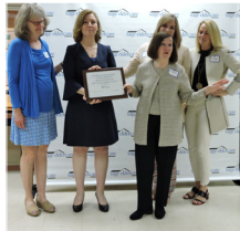
Summit Luminary Fund

Community Partner Award was initiated in 1996 to honor local individuals or businesses that generously share their expertise in support of SAGE and older adults in our community.