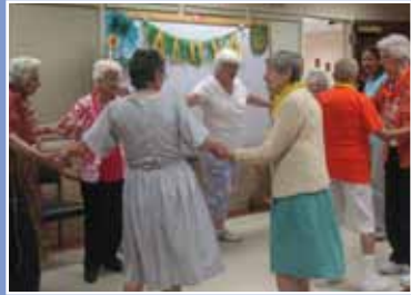
A summertime luau brought out the grass skirts, leis and Hawaiian music.