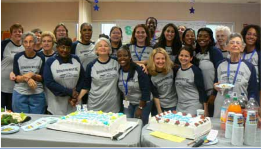
SAGE staff and volunteers celebrated the milestone with a birthday party, complete with birthday cake and commemorative t-shirts.